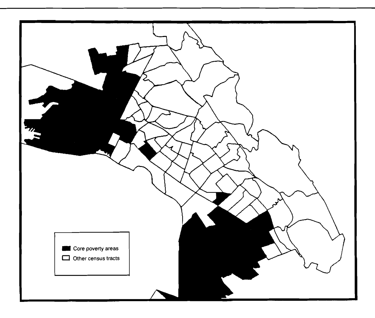
Figure 1. Oakland Poverty Areas Identified by Procedures of the Association of Bay Area Governments

Following standard health statistics convention, we define low-birth-weight rates as the percentage of the total births in a tract made up of infants weighing less than 2,500 grams. For all births during the years 1979–81, this rate was 12.2 percent within the poverty tracts and 7.7 elsewhere in Oakland. Given that the national low-birth-weight rate is 6.8 percent, 12 clearly the poverty tracts in Oakland exhibit exceptionally high rates.